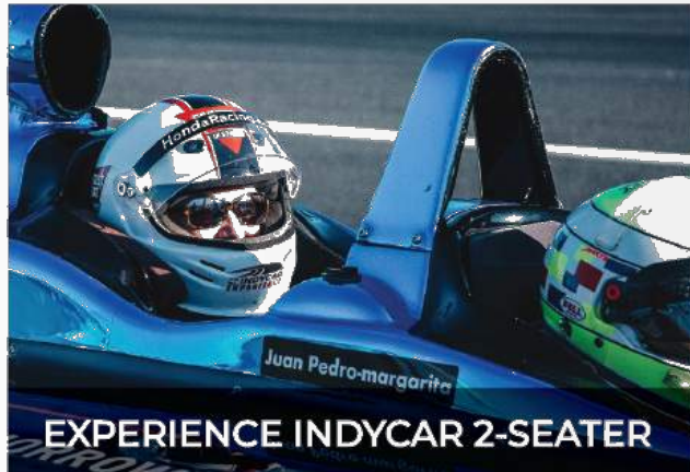
EXPERIENCE INDYCAR 2-SEATER