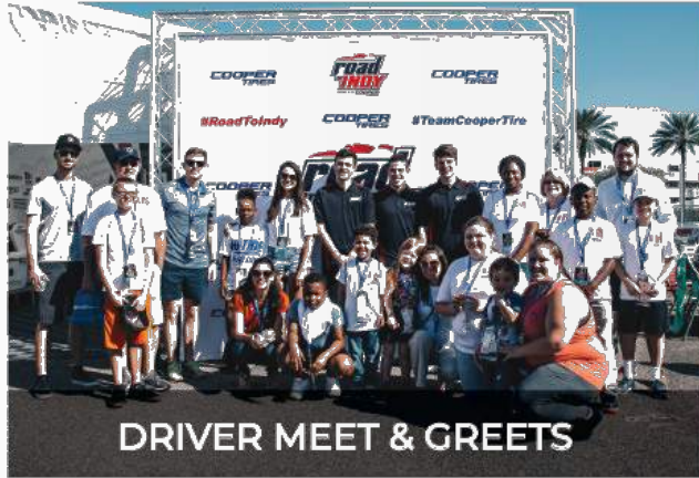
DRIVER MEET & GREETS