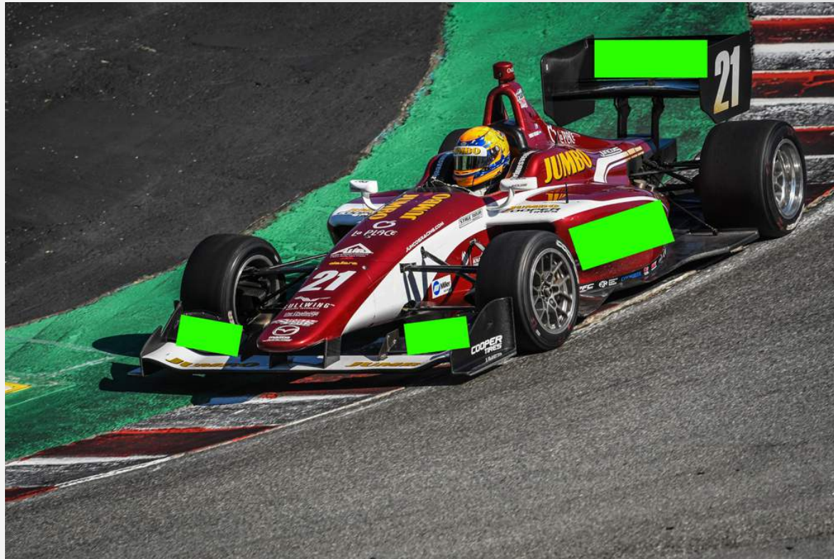
Branding possibilities on Road to Indy Scholarship Cars outlined in neon green