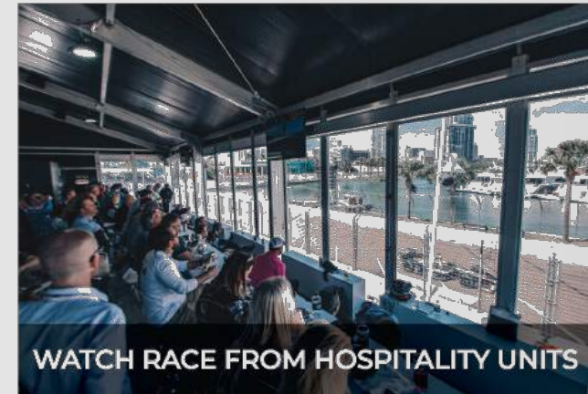
WATCH RACE FROM HOSPITALITY UNITS