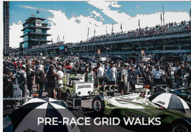
PRE-RACE GRID WALKS